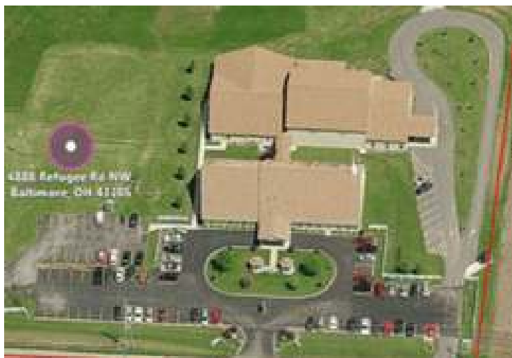
Aerial view of the new property of Oromo Evangelical Church of Columbus, Ohio.

After much prayer with the Oromo people and several visits to the site, we were convinced that God was going to give the congregation this building as a center for immigrants in east Columbus, where services such as child care, after-school programs, English classes, and sports