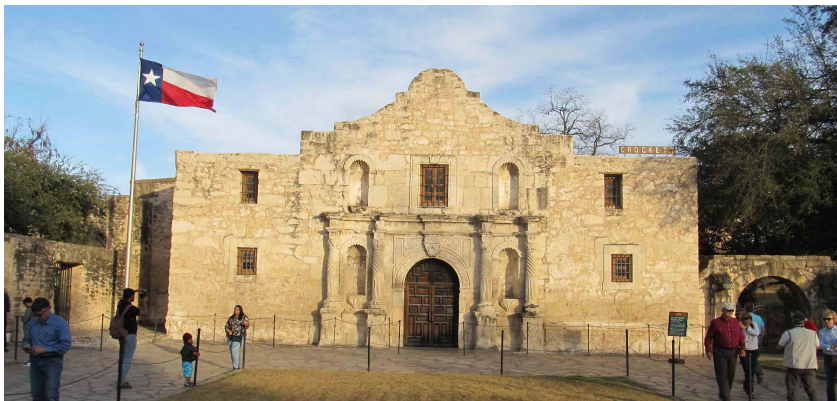
The Alamo was a short walk from the conference hotel.